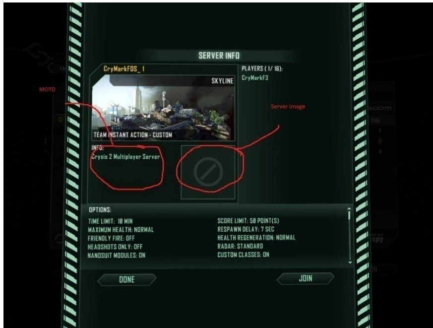
Server Info Screen showing MOTD and Server Image